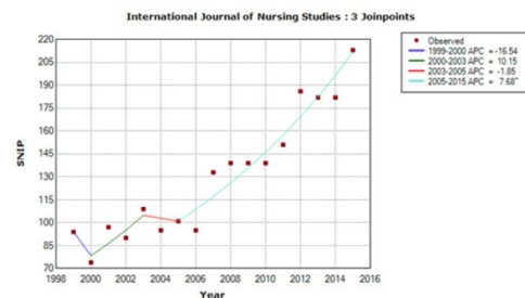
Figure 1 Trend model for the International Journal of Nursing Studies (IJNS)

SNIP values in the y-axis are shown without a decimal point (e.g., a SNIP value of 1.00 is represented as 100).