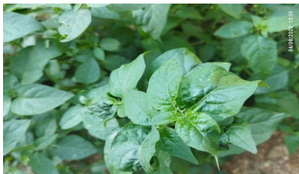
Figure 15 Leaves of Solanum spirale in the wild.

Its botanical name is Solanum spirale from Solanaceae (Potato family). Decoction of the leaves is used for the treatment of urinary retention and kidney stone. Berry juice is used for the treatment of boils, ringworms, and to remove water leeches from both people and animals' noses.