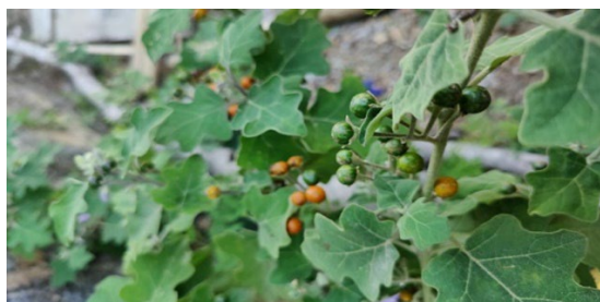
Figure 1 Leaves and fruits of Solanum violaceum Ortega in the wild.

Its botanical name is Solanum violaceum Ortega from Solanaceae (Potato family). The fruit juice is used topically to treat herpes. The green fruit was crushed and thus applied to the treatment of herpes. Additionally, the fruit is administered directly on hurting wounds.