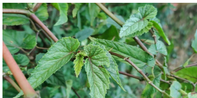
Figure 13 Young leaves of Begonia lushaiensis in the wild.

Its botanical name is Begonia lushaiensis from Begoniaceae (Begonia family). Decoction of the leaves and stems is taken orally for the treatment of dysentery, pile problem, diarrhoea, and malaria.