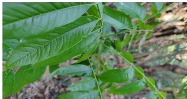
Figure 4 Leaves of Sapindus mukorossi in the wild.

Its botanical name is Sapindus mukorossi from Sapindaceae family. Consuming of the fruit pulp is used for the treatment of Pile disorder. Fruit juice is applied externally in mumps. One or two fruits are soaked in water overnight and the water is then used as a gargle for cough and tonsillitis. The fruit is a substitute for soap for the Mizo people in ancient times.