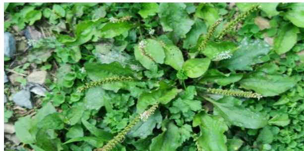
Figure 7 Leaves of Plantago major in the wild.

Its botanical name is Plantago major from Plantaginaceae family. The leaf juice is put in for earache and used locally for bee stings. To speed up the growth of new skin, the leaf decoction is applied directly to wounds and ulcers. It relieves toothaches and blisters on the gums. Decoction of the leaves is taken orally for the treatment of kidney and urinary problems, diabetes, malaria, and tuberculosis.