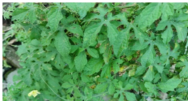
Figure 14 Leaves of Momordica charantia in the wild.

Its botanical name is Momordica charantia from Cucurbitaceae (Pumpkin family). The leaf juice is taken orally for the treatment of jaundice, and hypertension. The leaf juice is also used as nasal drops. It is also used externally and internally for dog bites.