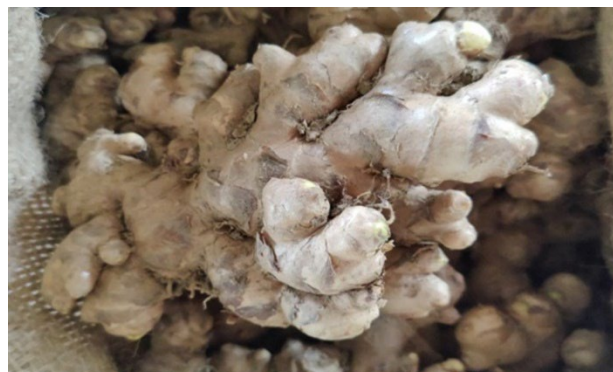
Figure 9 Shoot of Zingiber officinale .

Its botanical name is Zingiber officinale from Zingiberaceae family. Extract i.e. ginger oil is used in cough & bronchitis; rhizome is roasted & eaten against throat pain, applied as a condiment; flowering bunches are sold in local markets as a vegetable.