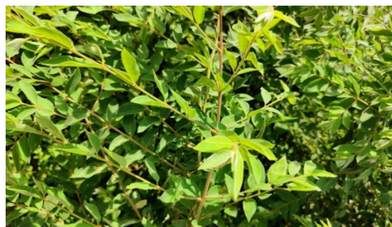
Figure 2 Leaves of Flueggea virosa in the wild.

Its botanical name is Flueggea virosa from Euphobiaceae family. The leaves are boiled and are used for taking baths for the treatment of Itching and Measles.