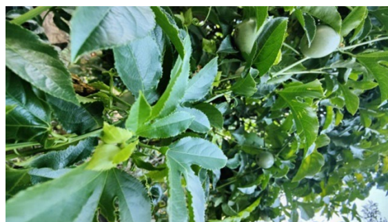
Figure 8 Leaves of Passiflora edulis Sims in the wild.

Its botanical name is Passiflora edulis Sims from Assifloraceae (Passion flower). This plant is used for treating jaundice. For medicine, the fruit is orally consumed. In order to control high blood pressure, the teas of the dried leaves were also consumed.