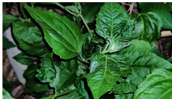
Figure 3 Leaves of Eupatorium odoratum in the wild.

Its botanical name is Eupatorium odoratum from Asteraceae family. The leaf juice is used topically as an anti-septic. The juice is also applied externally to remove pinworm from the anus.