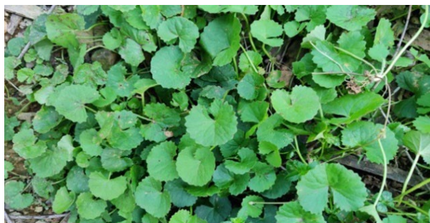
Figure 6 Leaves of Centella asiatica in the wild.

Its botanical name is Centella asiatica from Apiaceae (Carrot family). It is said that Centella asiatica is effective for the treatment of skin disorders. It is also popularly used as a memory stimulator. The leaves are boiled and the water is taken for the remedy of asthma and eye problems. Decoction of the dried leaves is also used for controlling hypertension. The leaf juice is also used as a remedy for blood purification.