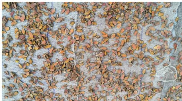
Figure 10 Dried Curcuma longa for further process.

Its botanical name is Curcuma longa from Zingiberaceae family. Mainly by crushing the rhizome, the plant is used for the treatment of ulcer, diarrhea, asthma, and heart diseases. For the treatment of intestinal colic, the young shoot of this plant is also taken orally. Crushed fresh rhizome is applied immediately to swelling, cuts, and sprains as well.