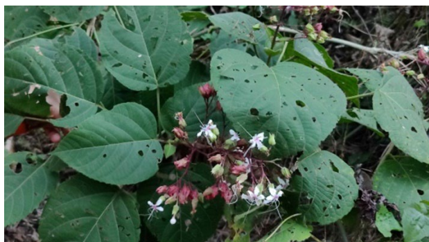
Figure 5 Leaves and flowers of Clerodendrum colebrookianum in the wild.

Its botanical name is Clerodendrum colebrookianum from Verbenaceae family. Decoction of the leaves 2-3 times daily is given orally in the treatment of hypertension and also in diabetes. 5ml of the leaf juice is given orally and twice daily to treat colic in infants.