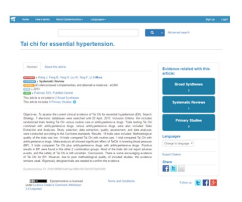
Figure 1 Article from search results for "Tai chi for essential hypertension"

Epistemonikos stand out is its support for multiple languages, which makes it more user friendly globally.